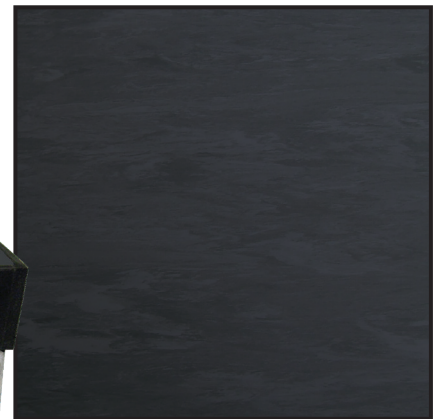
Galvanised Steel Top sheet and Bottom Tray