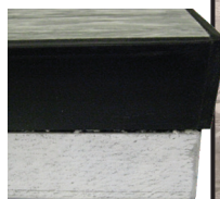
1/2 Depth 2mm ABS Edging