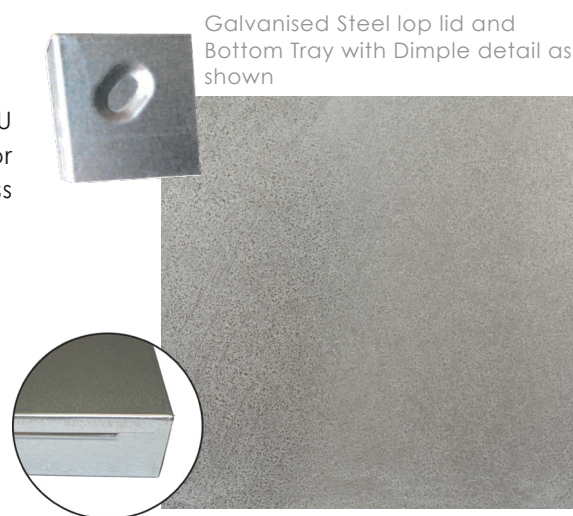
Galvanised Steel top lid and Bottom Tray with Dimple detail as shown