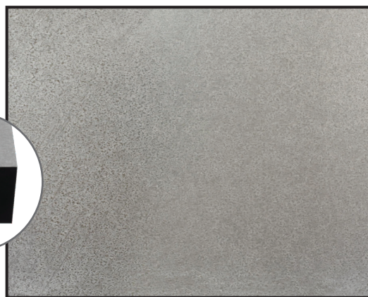
Galvanised steel top and bottom sheet