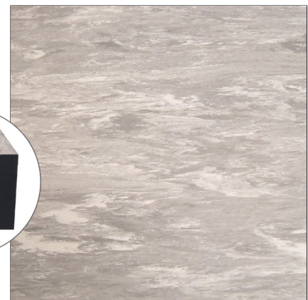
Galvanised steel top and bottom sheet with vinyl covering