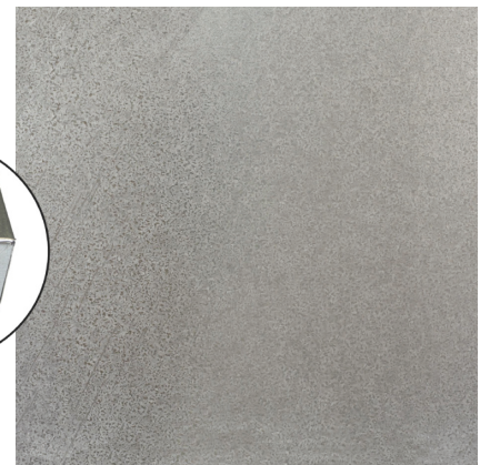
Galvanised Steel Top Lid and Bottom Tray