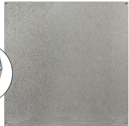
Galvanised Steel Top Lid and Bottom Tray

Wrap Around Tray Forming Encapsulation Pre-drilled holes for screw fixing