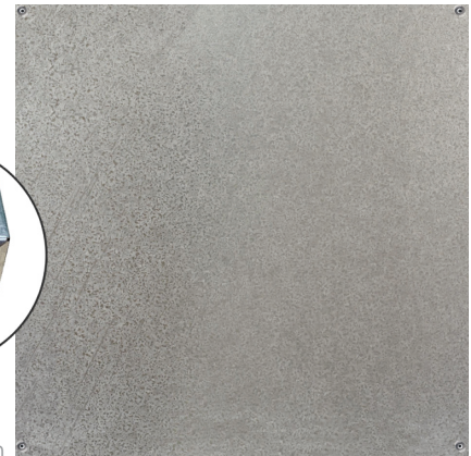
Galvanised Steel Top Lid and Bottom Tray