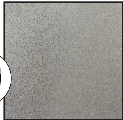
Galvanised steel top and bottom sheet