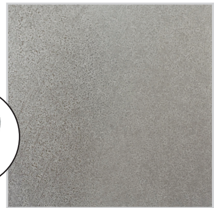
Galvanised steel top and bottom sheet