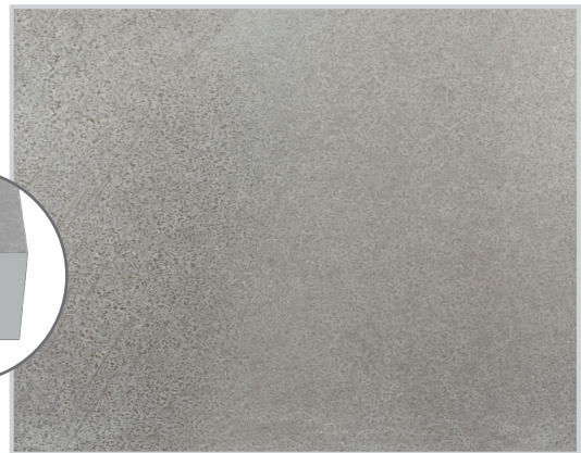
Galvanised steel top and bottom sheet